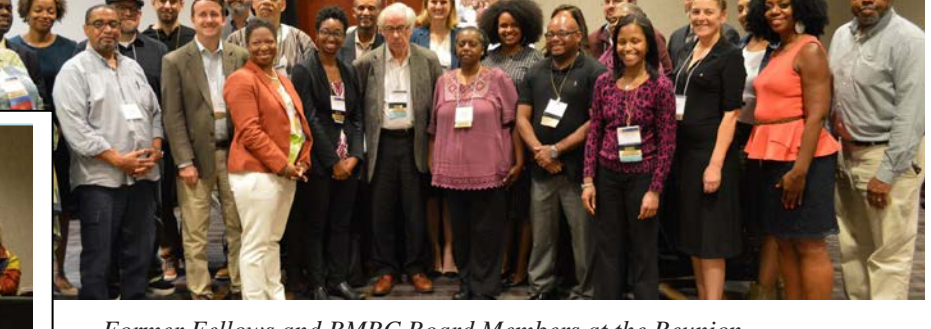
Former Fellows and BMRC Board Members at the Reunion

Over 50 participants converged in Indianapolis, Indiana for the first <u>Summer Short-term Fellows Reunion and (Inter)National Gathering of African American Studies Scholars</u>. Former Black Metropolis Research Consortium (BMRC) fellows from all throughout the U.S., Canada and France gathered to share research and scholarship, reflect on experience, fellowship,